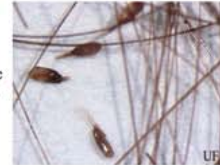
Figure 2: Nits (lice eggs)

Female head lice glue their grayish-white to brown eggs (nits) securely to hair shafts. The eggs are resistant to pesticides, and they are difficult to remove without a special 'nit-comb.' The nits are generally near the scalp, but they may be found anywhere on the hair shaft.