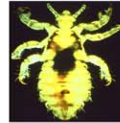
Figure 1: Head Louse Pediculus capitis

Head lice are small, wingless parasitic insects. They are typically 1/6-1/8 inch long, brownish in color with darker margins. The claws on the end of each of their six legs are well adapted to grasping a hair strand.